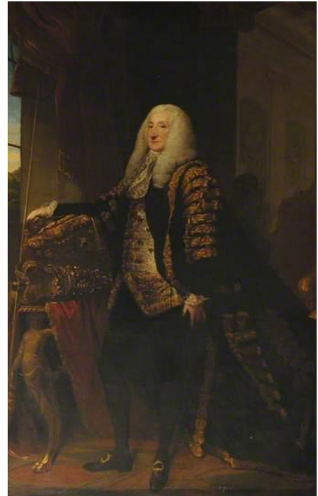
Henry Earl Bathurst, Lord High Chancellor