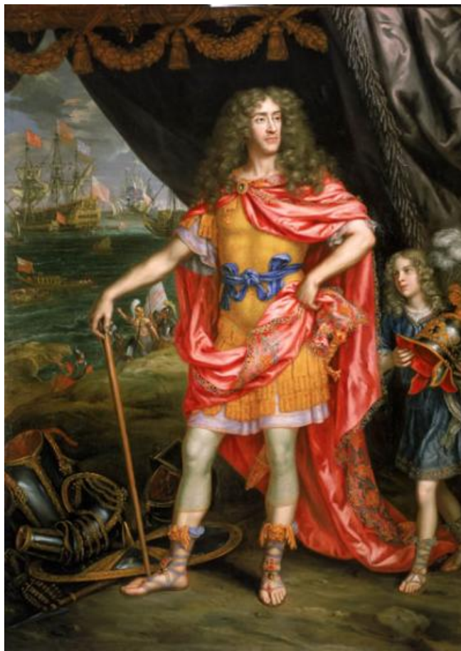
James Duke of York who became James II