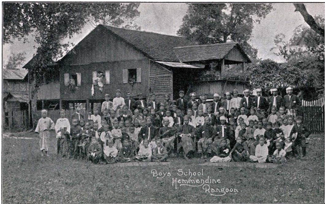
Boys School Hemmendine Rangoon.