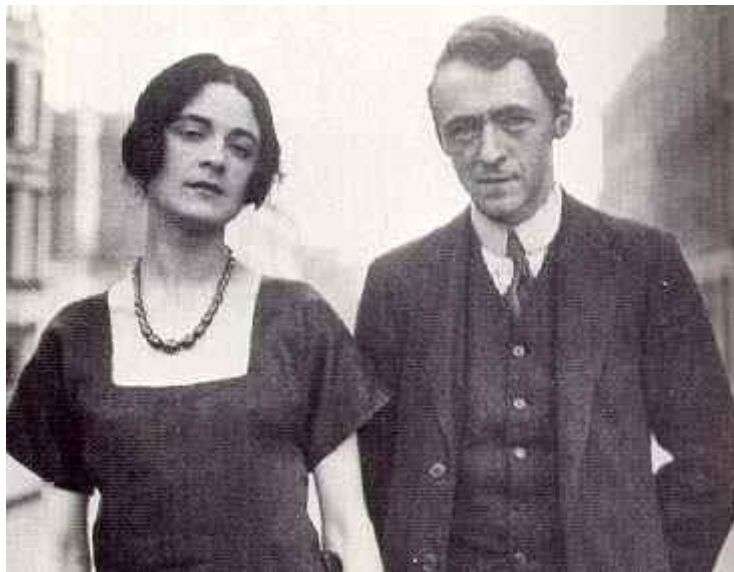
Harriet Cohen and Arnold Bax.

Cohen was chosen by Elgar to record his Piano Quintet, and she made many first recordings of music by Bax, her intimate friend, most of whose piano works, including a left-hand Concertante, were composed for her. In 1932 twelve leading British composers published transcriptions in A Bach Book for Harriet Cohen . She herself published some Bach transcriptions and a small book on interpretation, Music's Handmaid (London, 1936, 2/1950), while her memoirs, A Bundle of Time (London, 1969), are valuable for letters from friends eminent in all walks of life. (From the Grove Dictionary of Music)